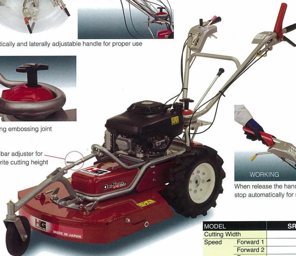
Roll bar adjuster for favorite cutting height