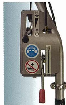
Easy operation by the refined control panel