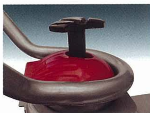
Strong embossing joint