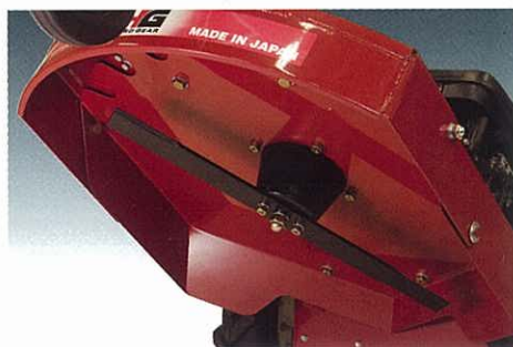
Reversible rotary blade (600mm) to cut bush and thick grass